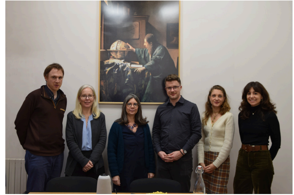
TEACHER EDITING ADVISORS