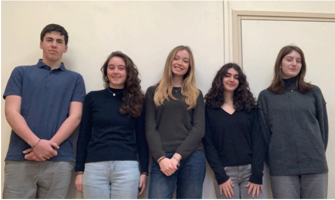
STUDENT PUBLISHING TEAM